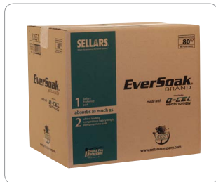
Preferred Pads Outer Case