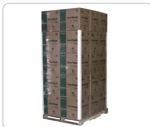
Preferred Pads Outer Case on a Pallet

To order, contact your Authorized Sellars® Distributor