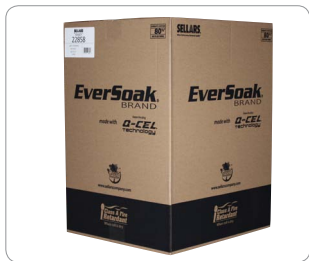
STANDARD Roll Outer Case

Caution: Not for use with aggressive acids or caustics