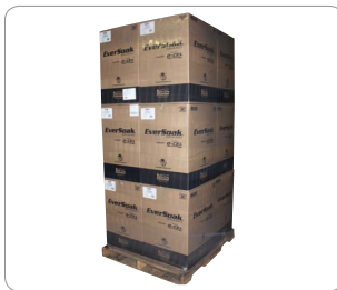
STANDARD Roll Outer Case on a Pallet