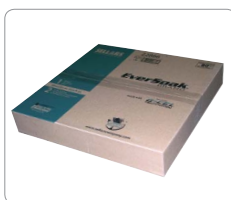
Preferred Barrel Top Pads Outer Case

Caution: Not intended for use with aggressive acids or caustics. Dispose of all sorbent materials in accordance with local, state and federal regulations.