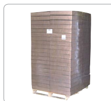
Preferred Barrel Top Pads Outer Case on a Pallet