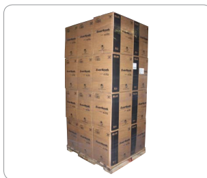
STANDARD Pads Outer Case on a Pallet

To order, contact your Authorized Sellars® Distributor