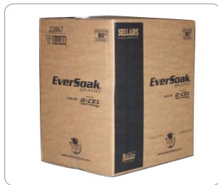
STANDARD Pads Outer Case