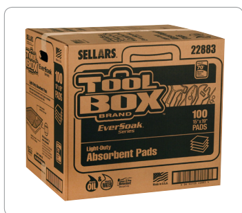
EverSoak® Light-Duty Absorbent Pads Outer Case

To order, contact your Authorized Sellers® Distributor